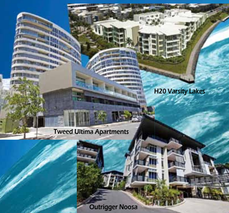
H2O Varsity Lakes