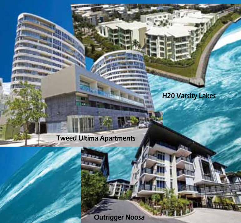
H2O Varsity Lakes